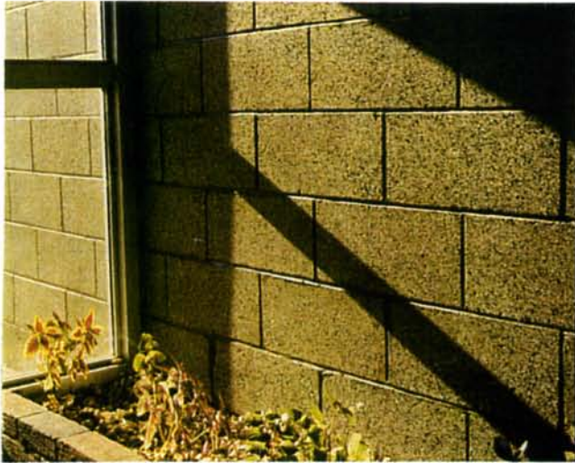
CRYSTAL CLEAR when applied to ground face block or exposed aggregate treatments highlight stone colors and texture.

Use on interior or exterior walls, floors, patios, walks and decks in industrial, schools, institutions, commercial and residential buildings.